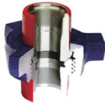
15,000 PSI CWP (FIG - 1502)